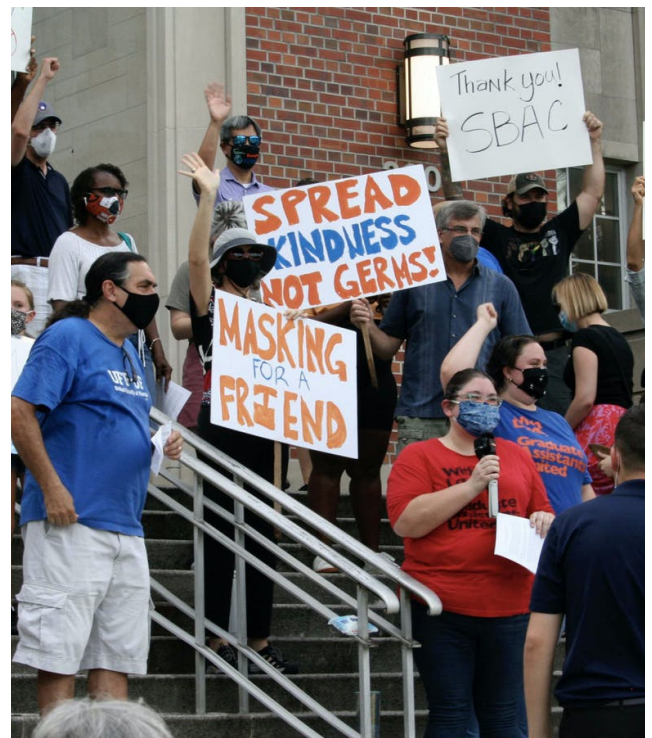
Pictured: UFF-UF and UF-GAU members and leaders

See pictures of the joint UF/UF-GAU rally here , published in The Independent Florida Alligator .