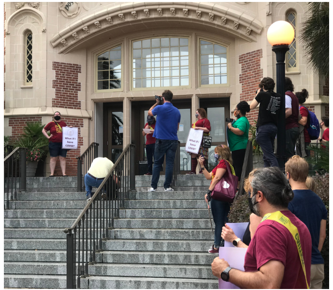
Pictured: FSU-GAU, FSU, and FAMU-GAU members and leaders

You can keep up with all of UFF's media coverage here .