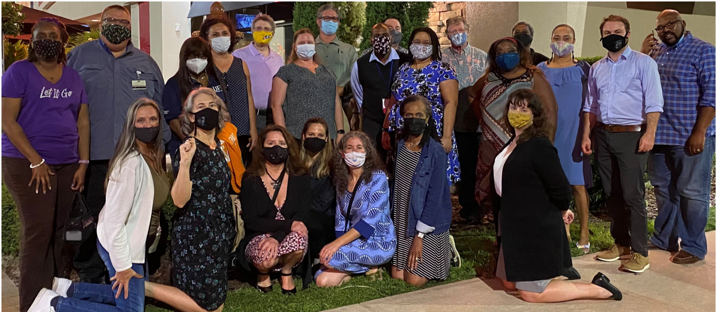
Pictured: UFF officers, staff, and local leaders from over a dozen chapters across the state.