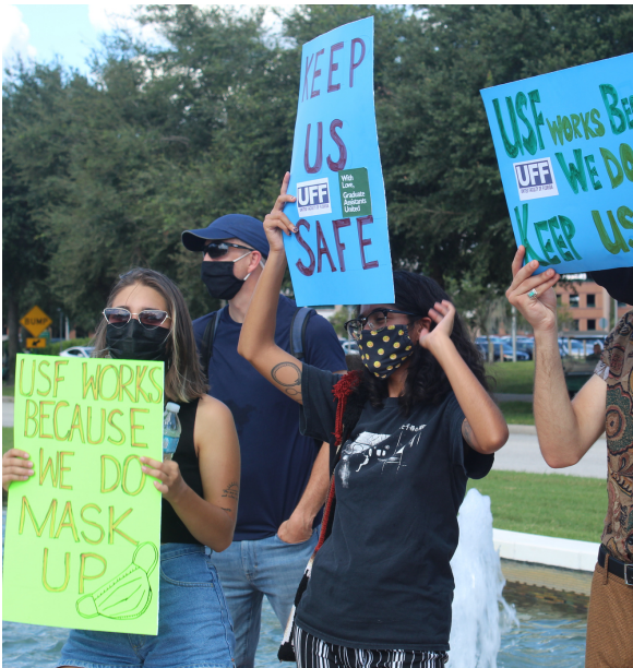
Pictured: USF-GAU leaders and members promoting better health and safety conditions on campus.

Actions like these make our union stronger by showing members and non-members alike that we care about more than just our contracts--we care about the people those contracts serve!