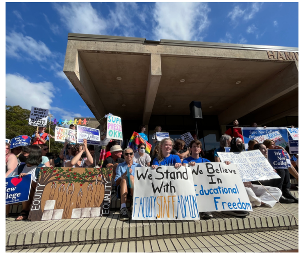
Pictured: New College students gathering to protest outside of the Board of Trustees meeting