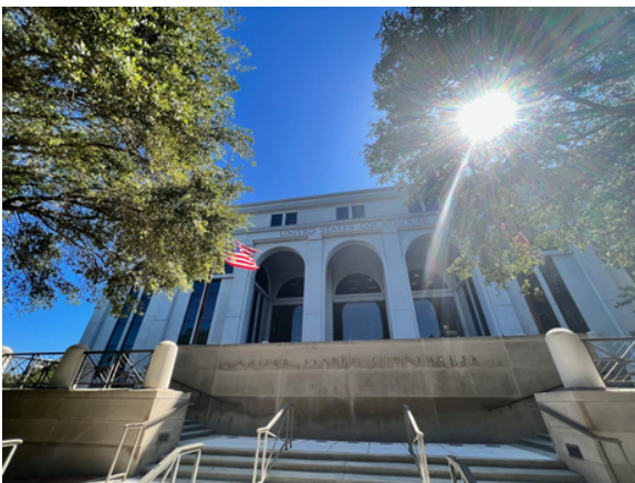
Pictured: Courthouse for the U.S. District Court for the Northern District of Florida.